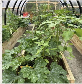
#76 - Horticulture facilities for the local community