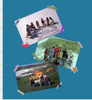
#106 - Youth Club