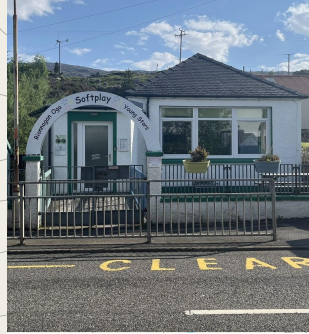
#98 - Improvements to the Softplay building