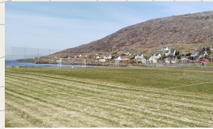
#60 - All weather facility